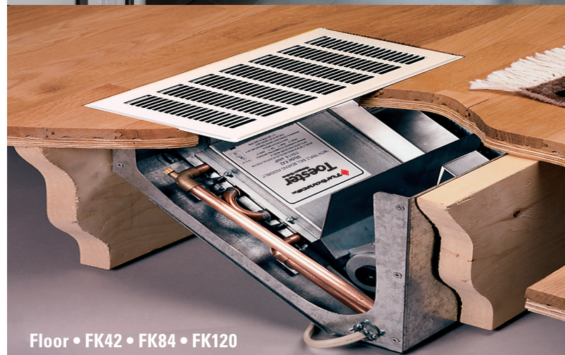
Floor • FK42 • FK84 • FK120