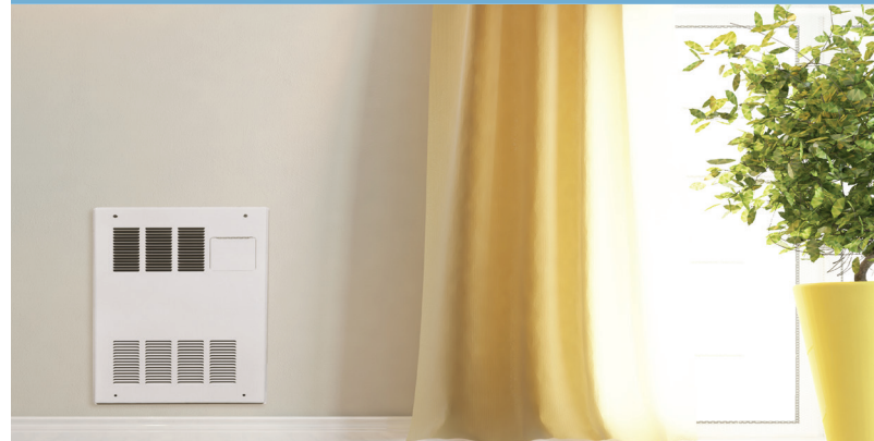
Recessed • W42 • W84 • W120