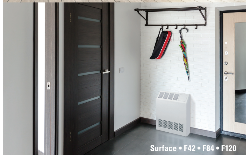
Surface • F42 • F84 • F120